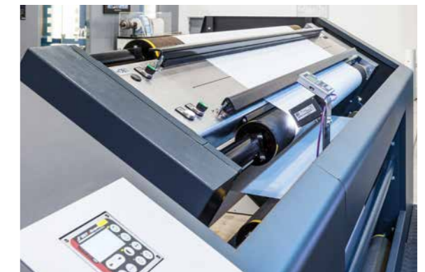
Splicing table High-quality splices made simple.