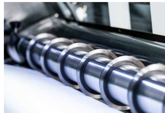
Scissor cut For best quality with long service life.